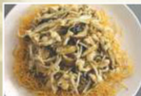
Chicken Pan Fried Noodle

🍴 Hot & Spicy - We can alter the spice to your taste There will be a $2 sharing charge per person on all main courses, except when soup or appetizer has been ordered.