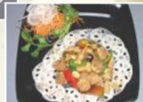
Lotus Root with Beef