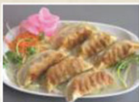
Pan Fried Dumpling